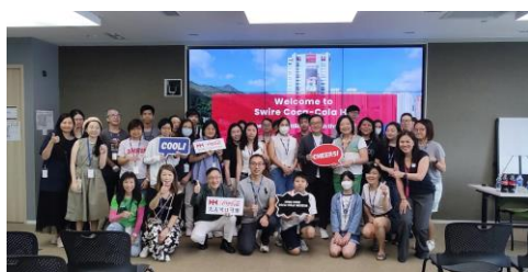
Innovative and Sustainable Manufacturing in Coca Cola Plant Tour on 13 July 2024