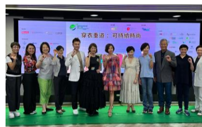
Fashion Reimagined: Sustainable Wardrobes Seminar on 16 Aug 2024