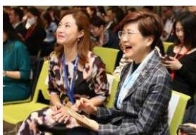
Corporate Talks at China CITIC Bank International in Feb 2024

To attract the public to participate in the carbon neutrality competition, we held 2 tours, 4 workshops, 6 seminars, and 9 talks to educate and raise their awareness to adopt sustainable low-carbon lifestyles in all aspects of clothing, food, living, and travel during Jan to Aug 2024. Participants who demonstrate outstanding reduction will have the opportunity of winning prizes such as flight tickets from Cathay and Ocean Park admission tickets. To facilitate participation and record-keeping, a dedicated competition online platform has been created by HKPC, our implement agent. Thanks to the collaborative efforts of various stakeholders and our OC members, we surpassed our planned target of 8,000 competition participants and successfully registered over 12,500 participants which surpassing all expectations and possibly the record for similar initiatives. Now, this competition is on the third stage of the data input. We still need help from OC members and hope all of you will journey on with us till the end of this competition.