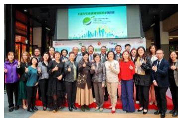
Towards Sustainable and Smart Living Seminar on 3 Mar 2024